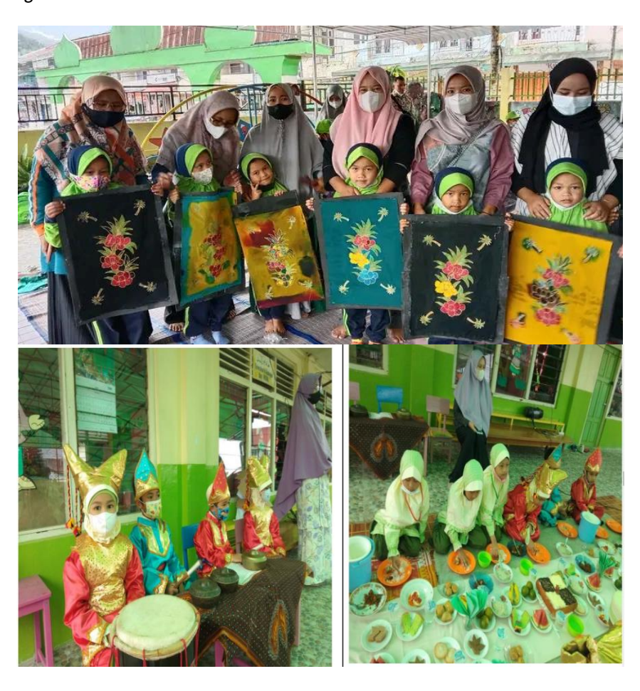
Figure 2. Activities to play traditional tambua, talempong, bajamba eat, and tanah liek batic

Harum baunnyo sibungo rampai Jadi pamenan sianak daro Sabalum makan jo minum kakito mulai Mari kito badoa basamo-samo